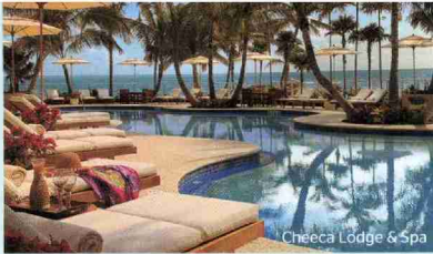
Cheeca Lodge & Spa