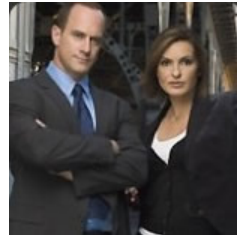
SVU: Who's Leaving?