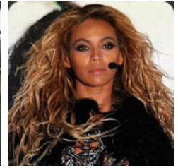
Beyonce Plagiarism Claims