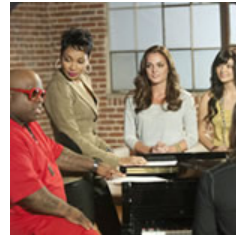
Voice: Week 3 Battles