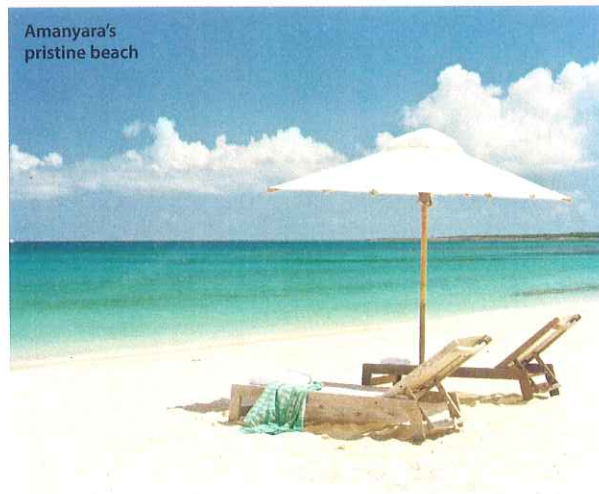
Amanya's pristine beach

GO AHEAD, INDULGE: Each open-air suite has a private entrance accessed via a palm-lined, crushed-shell path. Inside, sumptuous touches include water views, platform beds, and free-standing spa tubs. Enjoy sunbathing pads and sunken Japanese-style tables on two additional terraces.