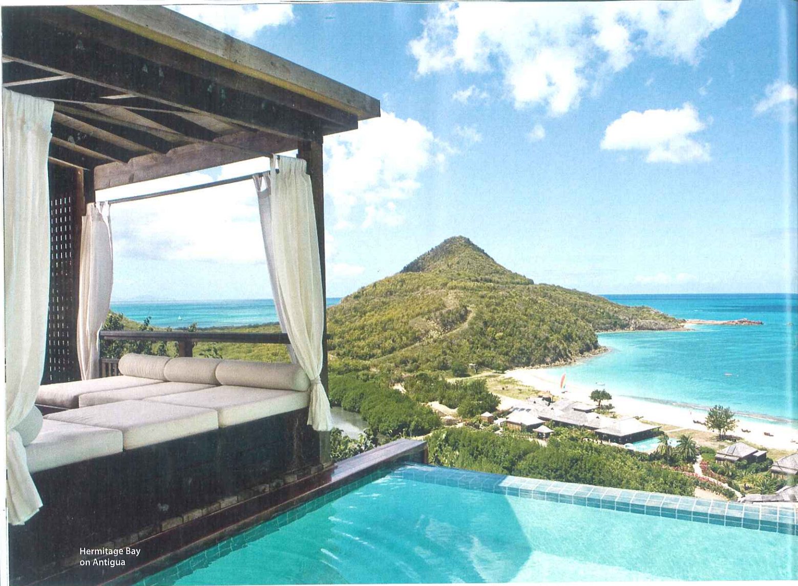
Hermitage Bay on Antigua

toes-in-the-sand chic at the Flying Fishbone restaurant, 20 minutes from Bucuti; flyingfishbone.com.