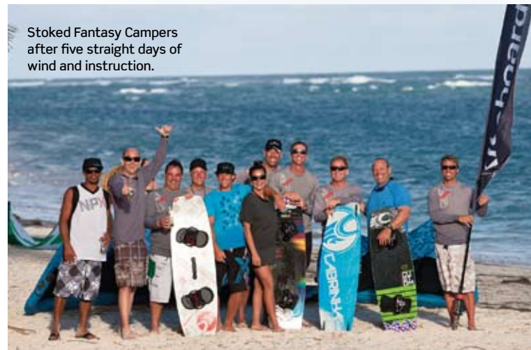
Stoked Fantasy Campers after five straight days of wind and instruction.

lush coastline. The campers hit the water and sessioned the new spot with lots of enthusiasm. It was difficult to complete the downwinder since getting out of the huge bay in on-shore conditions was tough for the crew. Nonetheless, it was cool to see the campers venture out of their comfort zones, and they all seemed to have fun despite getting hammered