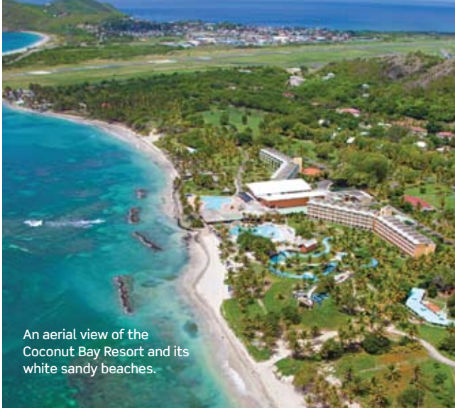
An aerial view of the Coconut Bay Resort and its white sandy beaches.