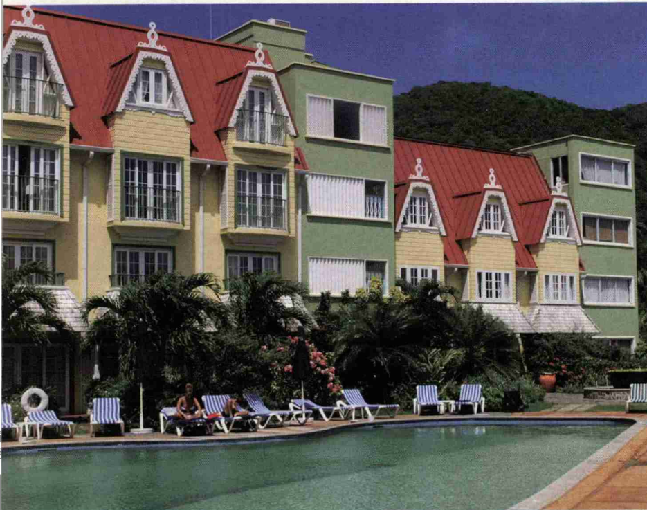
Coco Palm offers easy access to the island's northern treasures.