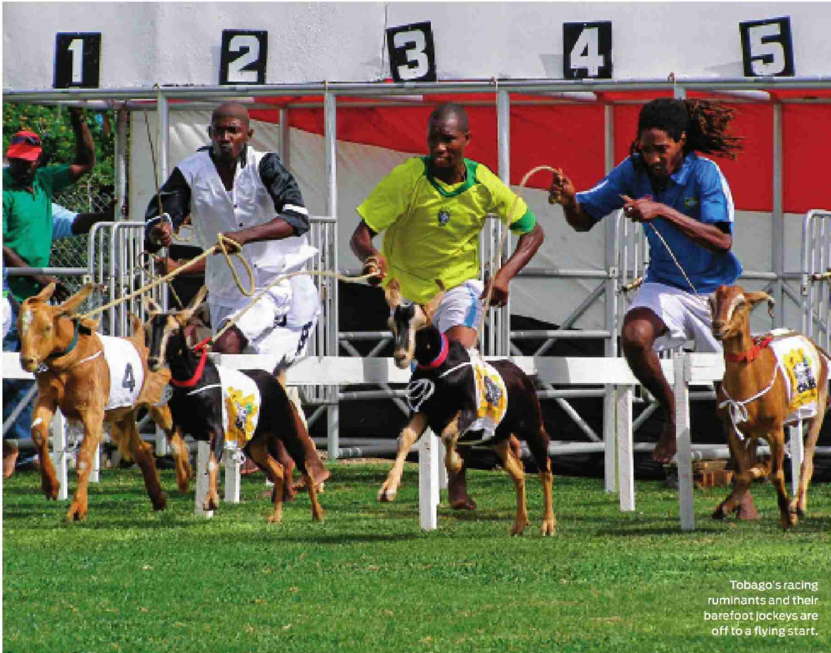
Tobago's racing ruminants and their barefoot jockeys are off to a flying start.