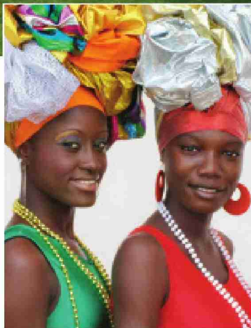
Race day brings big excitement to tiny Tobago. Combining local color, spirited competition and racing pageantry, it's been the highlight of the island's sporting calendar for almost a century.